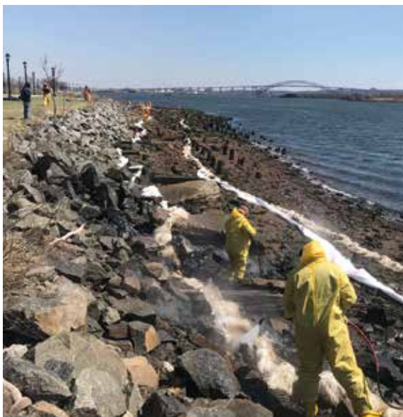
Pressure washing an oiled shoreline, USA

An excellent example of the value of ITOPF's investment in training and education was afforded by an opportunity to assist the Brazilian