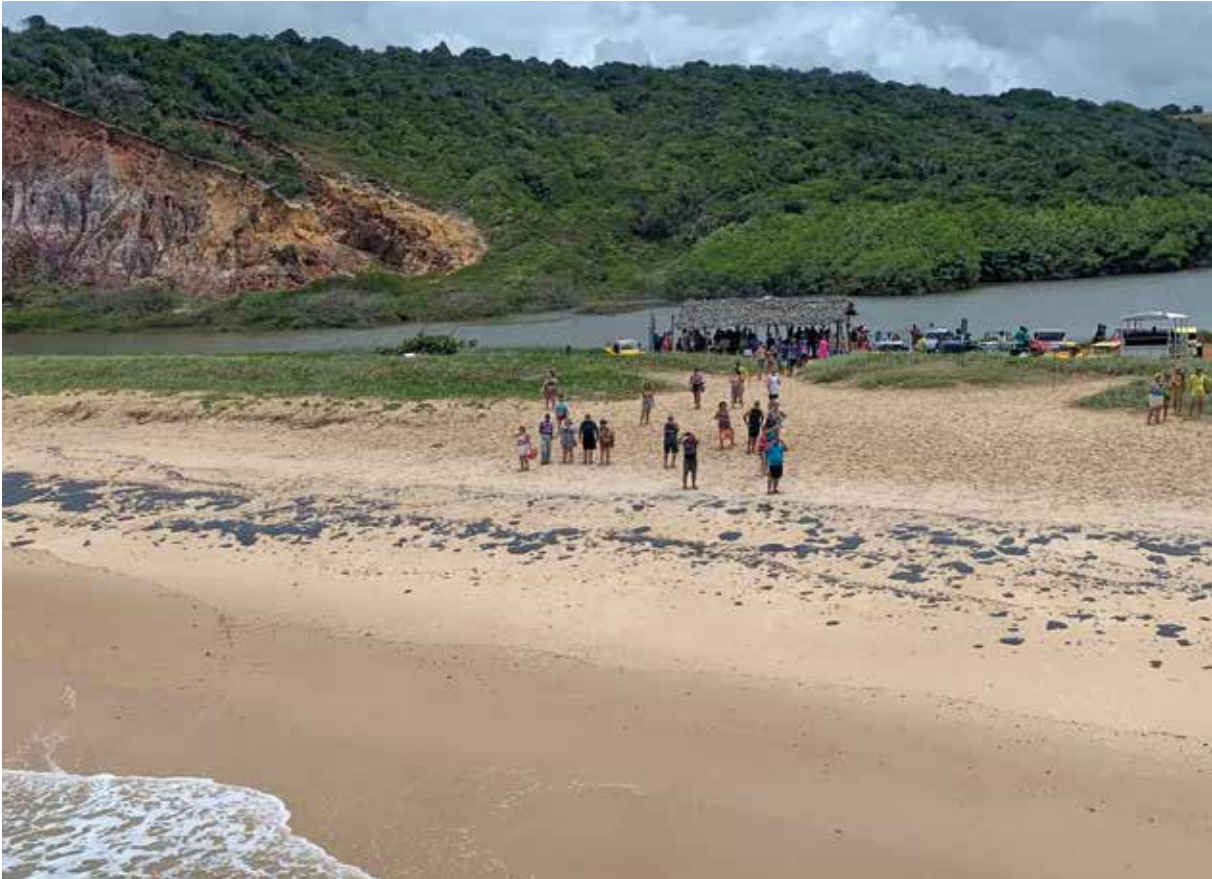
Shoreline oiling from an unknown source in Brazil