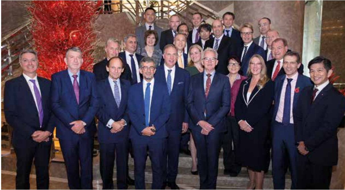
ITOPF Board of Directors, November 2019