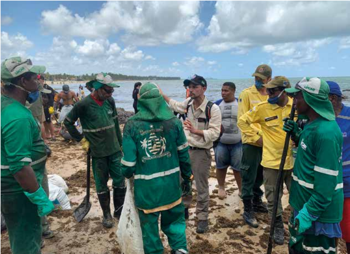
ITOPF providing advice on-site in Brazil