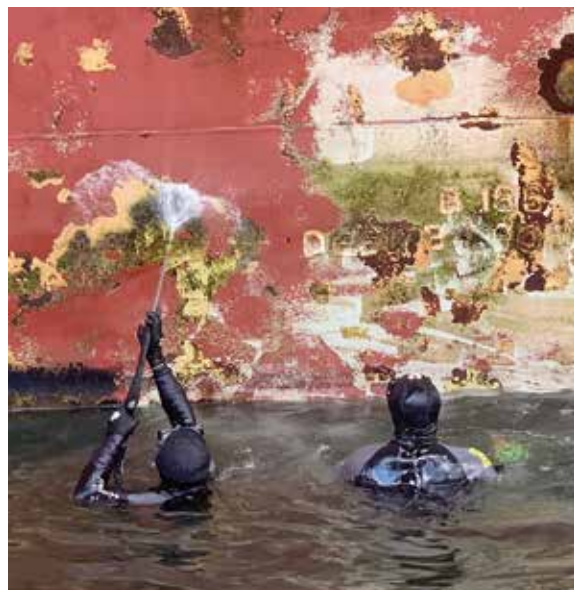
Cleaning an oiled hull, Colombia