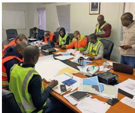
Transboundary oil spill response exercise, Namibia