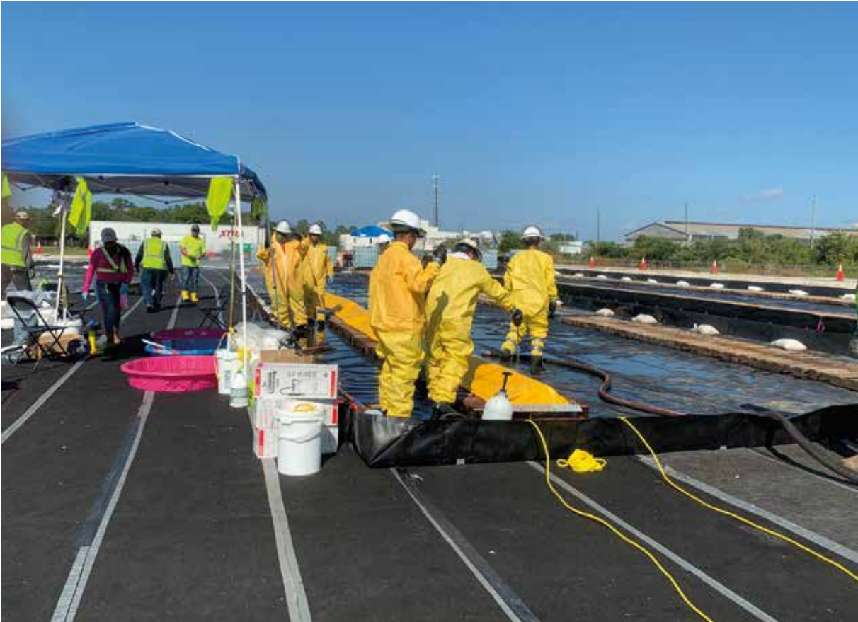
Cleaning oiled boom, USA