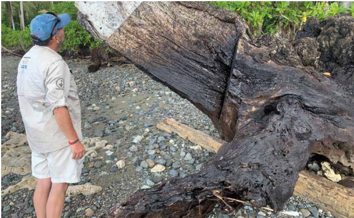
ITOPF investigating an oiled shoreline, Indonesia

countries (Algeria, France, Italy, Malta, Morocco, Spain and Tunisia) and is supported by three Secretariats (REMPEC, the OSPAR/Bonn Agreement and HELCOM) and, in addition to ITOPF, two other institutes (CEDRE and ISPRA). The project is divided into six work packages and ITOPF has committed 140 days from January 2019 to December 2020. ITOPF's involvement includes work to update decision support tools (including writing of the 'Marine HNS Response Manual', in collaboration with CEDRE and ISPRA), reviewing national contingency plans (through workshops and written recommendations), and providing training to enhance co-operation and preparedness within the region. The 'kick-off' meeting took place in March and, since then, the team has undertaken significant work to progress this project with more to follow during 2020.