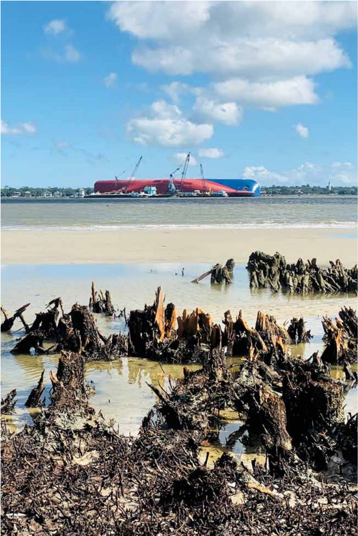
Grounded car carrier, Georgia, USA