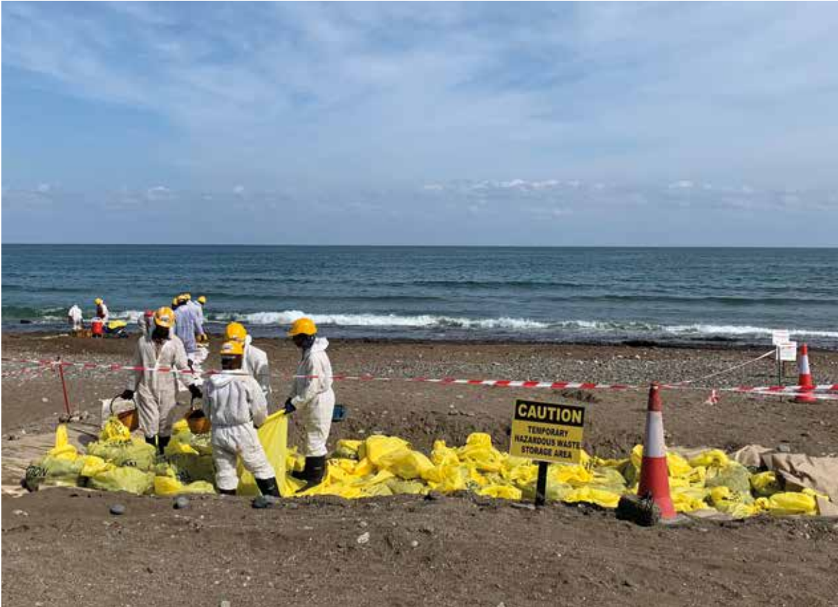
Shoreline clean-up, Oman