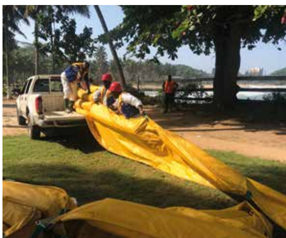
Exercise to test national contingency plan, Côte d'Ivoire

The winner of the 2019 ITOPF R&D Award was the Norwegian research organisation, SINTEF, for a project on the characterisation of low sulphur fuel oils (LSFO). This project is timely given the IMO 2020 regulations, which came into effect in January, limiting the sulphur content of fuel oils. ITOPF's R&D Award will help to fund a one-year study to document the weathering properties and behaviour of LSFOs when spilled at sea. The project is also funded by the Canadian government "Multi-partner Oil Spill Research Initiative program" (MPRI) and the Norwegian Coastal Administration (NCA), thus providing additional value by strengthening relationships and sharing scientific knowledge.