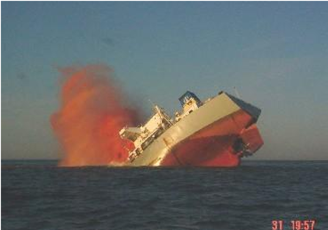
'FU SHAN HAI' sinking with a cargo of Potash in the Western Baltic Sea, 2003.